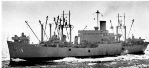
USS Polaris (AF-11)